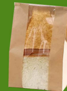
Paper bags with clear windows