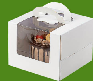
Cake food packaging boxes