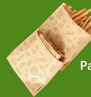
Paper snack bags