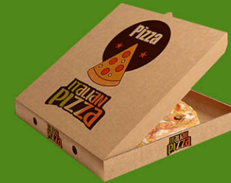
Packaging food boxes