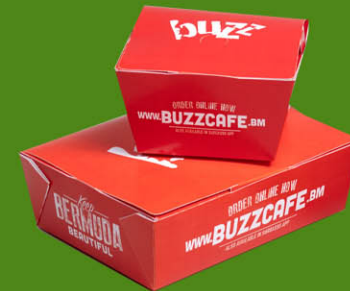
Cardboard box packaging for foods