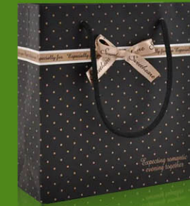
Custom paper gift bags