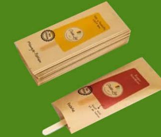
Custom printed Popsicle packing paper bags