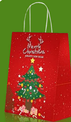
Christmas paper gift bags