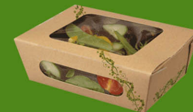
Paper boxes food packagings