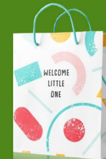
Food shopping bag custom gift bags