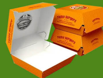
Food box packagings