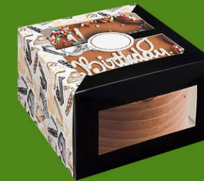
Custom food packaging boxes