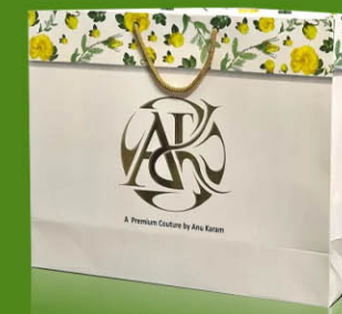
Kraft paper bag custom paper gift bags