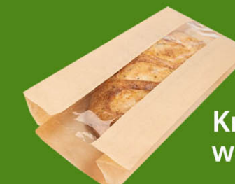
Kraft food bags with windows