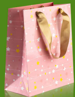
Paper bag gift bag with ribbon gift bags