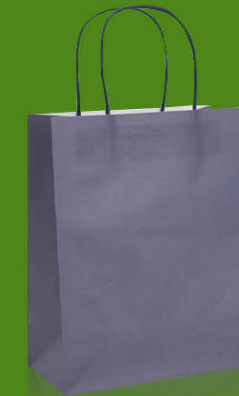
Paper gift bags with handles