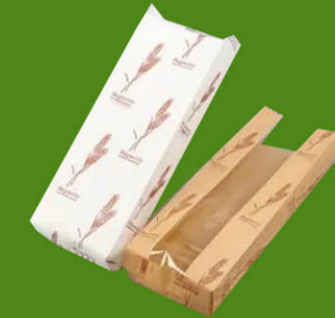
Printed greaseproof paper bags for foods