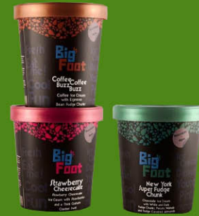
Luxury food packaging boxes