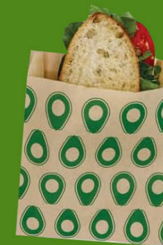
Lunchskins paper sandwich bags