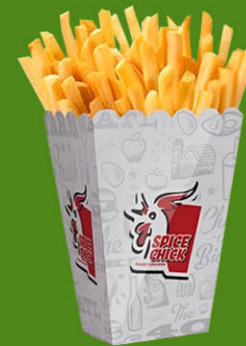
Custom food packaging boxes