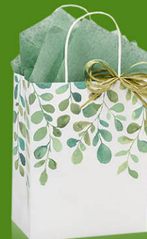
Paper bag gifts