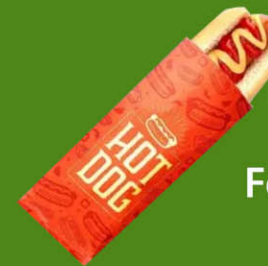
Foil hot dog bags