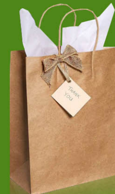
Kraft paper gift bags