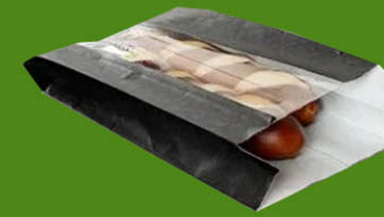
Custom printed food packaging paper bag with windows